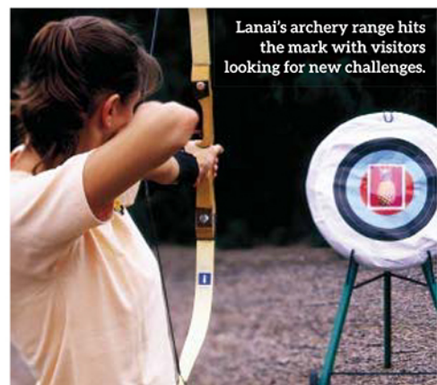
Lanai's archery range hits the mark with visitors looking for new challenges.

newest resort, THE WESTIN NANEA OCEAN VILLAS, KAAPALI . Opening this summer in north Kaanapali, it will offer one-, two- and three-bedroom villas with full kitchens and washer-dryers.