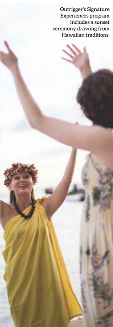
Outrigger's Signature Experiences program includes a sunset ceremony drawing from Hawaiian traditions.