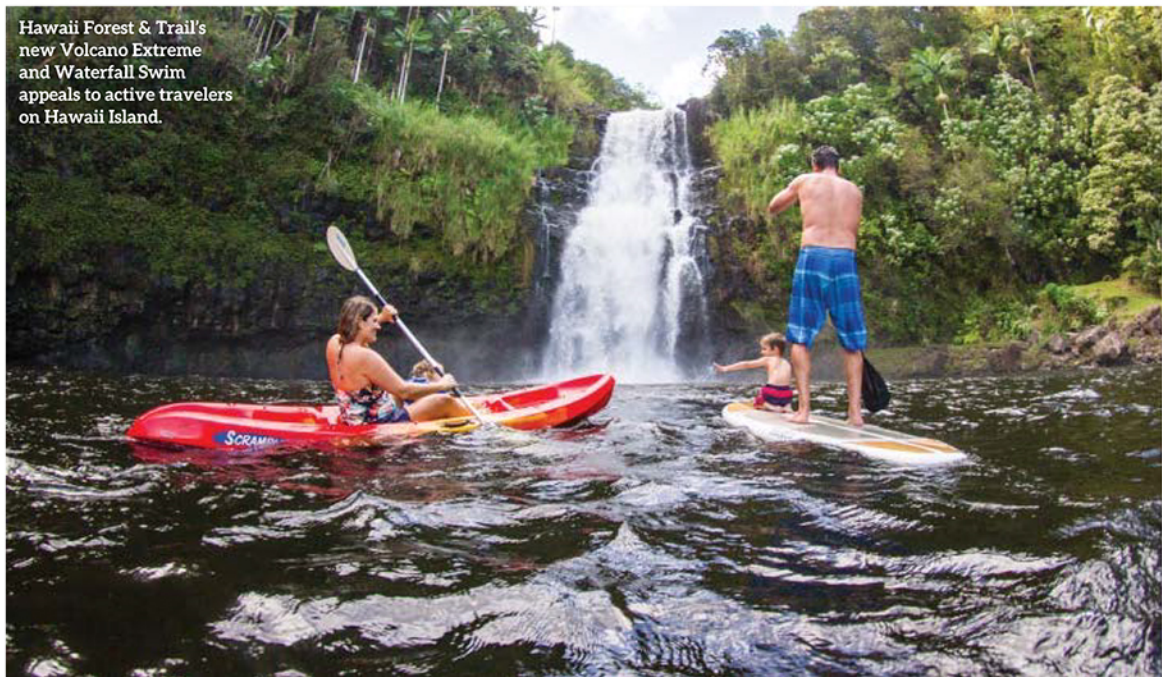
Hawaii Forest & Trail's new Volcano Extreme and Waterfall Swim appeals to active travelers on Hawaii Island.