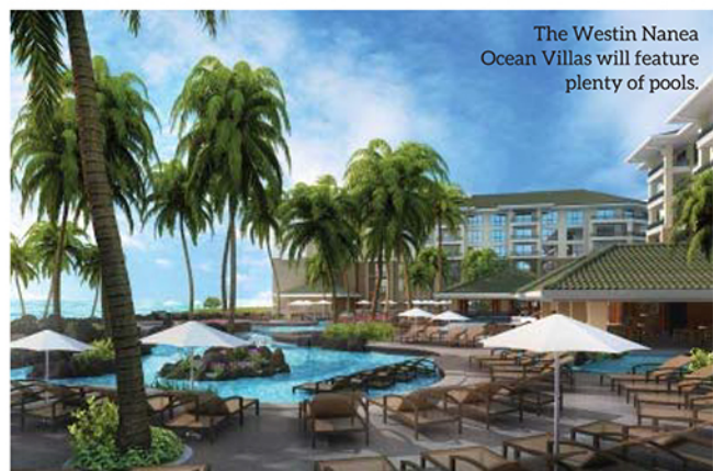
The Westin Nanea Ocean Villas will feature plenty of pools.

ALOHI LANI RESORT , a $115 million restoration of Pacific Beach Hotel, will unveil the results of its ambitious redevelopment this fall.